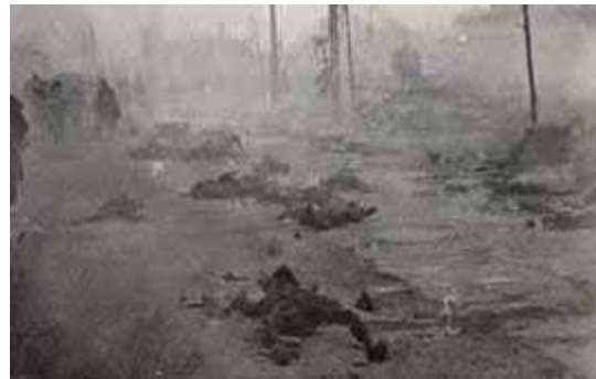
Aftermath of the Tokyo firebombing

The first “fire bomb” raid was on Kobe on February 3, 1945 and following relative success the AAF continued the tactic. Much of the armor and the defensive weapons of the bombers were also removed to allow increased bomb loads, Japanese air defence in terms of night-fighters and anti-aircraft guns was so feeble it was hardly a risk. The first such raid on Tokyo was on the night of February 23-24 when 174 B-29s destroyed around one square mile of the city. Following on that success 334 B-29s raided on the night of March 9-10, dropping around 1,700 tons of bombs. Around 16 square miles (41 km 2 ) of the city were destroyed and over 100,000 people are estimated to have died in the resulting “fire storm”. It was the most destructive conventional raid of the war against Japan. In the following two weeks there were almost 1,600 further sorties against the four cities, destroying 31 square miles in total at a cost of only 22 aircraft. There was a third raid on Tokyo on May 26. [Wikipedia]