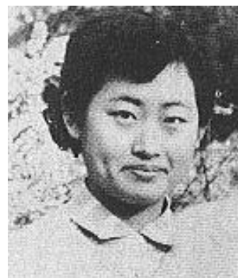
樺 美智子 1937.11.08 ~ 1960.06.15: 警官隊との 衝突が繰返される中で圧 死-蠟座

[From: http://www.tomiyamaharuo.com/essay_fukushima.htm ]