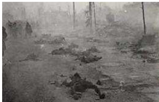
Aftermath of the Tokyo firebombing

The first “fire bomb” raid was on Kobe on February 3, 1945 and following relative success the AAF continued the tactic. Japanese air defences were feeble. The first raid on Tokyo was on the night of February 23-24 when 174 B-29s destroyed around one square mile of the city. On the night of March 9-10, 334 B-29s raided, dropped around 1,700 tons of bombs, destroying about 16 square miles (41 km 2 ) of the city and killing an estimated 100,000 people in the resulting “fire storm” in what was the most destructive conventional raid in the war against Japan. The next two weeks saw almost 1,600 further sorties against Japan’s four major cities, destroying 31 square miles in total at a cost of only 22 aircraft. There was a third raid on Tokyo on May 26.